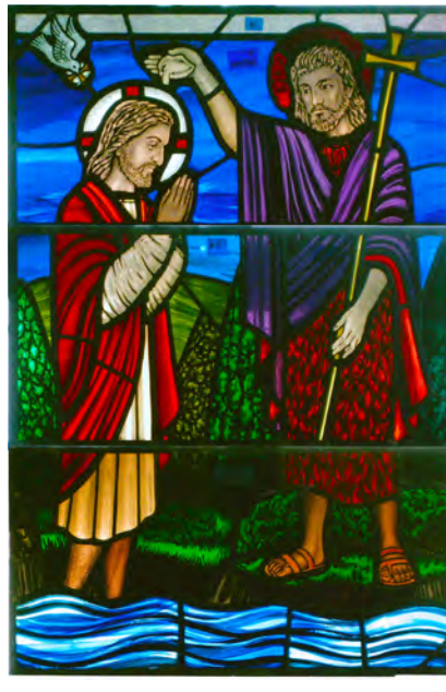
Holy Trinity Church, San Pedro, CA Restoration, 2014