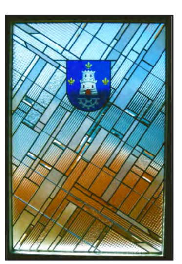
Molina Coat of Arms, Naples Island, Long Beach, CA, 2018