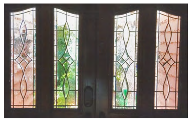
Entryway, Private residence, Rancho Palos Verdes, CA, 2017