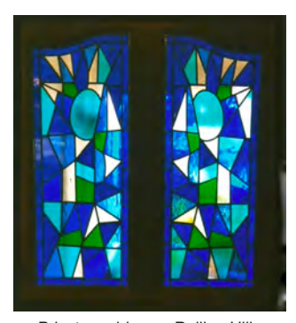
Private residence, Rolling Hills Estates, CA 2018 Door panels inspired by the Gaudi windows at La Sagrada Familia, Barcelona.