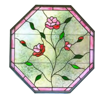
Stairway landing, Private residence, Torrance, CA, 2017